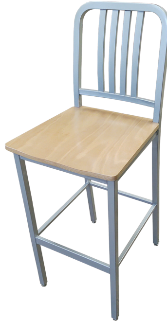
Natural Wood Seat BM-256-N