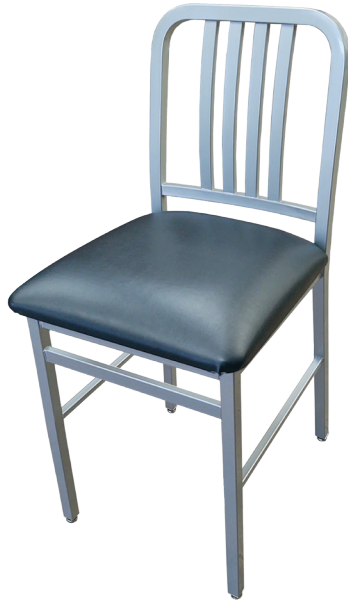
Black Vinyl Seat CM-256-BLK