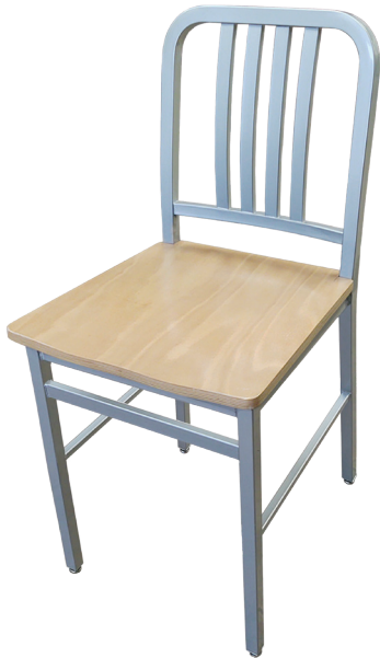
Natural Wood Seat CM-256-N