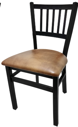
Buckskin Vinyl Seat SL2090-BUC