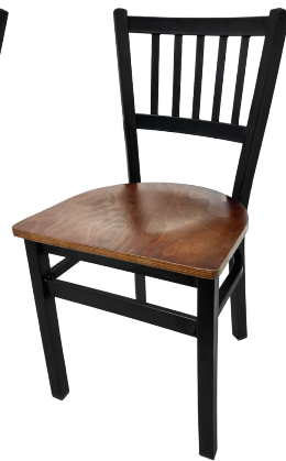
Walnut stain Wood Seat SL2090-WA