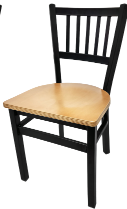
Clear Coat Wood Seat SL2090-N