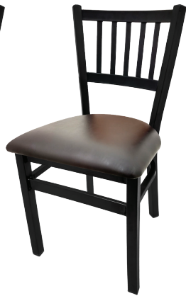
Espresso Vinyl Seat SL2090-ESP