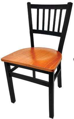
Cherry stain Wood Seat SL2090-C