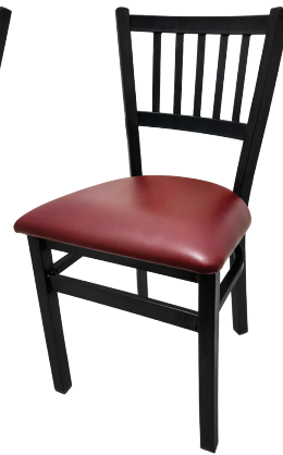
Wine Vinyl Seat SL2090-WINE