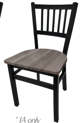
* IA only Barnwood Wood Seat SL2090-BW*