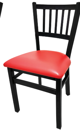
Red Vinyl Seat SL2090-RED