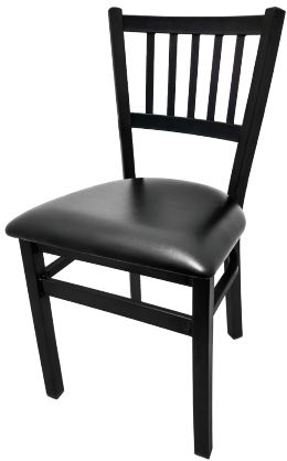
Black Vinyl Seat SL2090-BLK