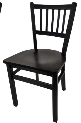
Black stain Wood Seat SL2090-WB