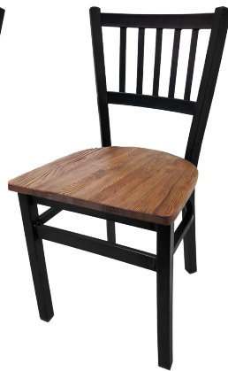
Reclaimed Wood Seat SL2090-RW