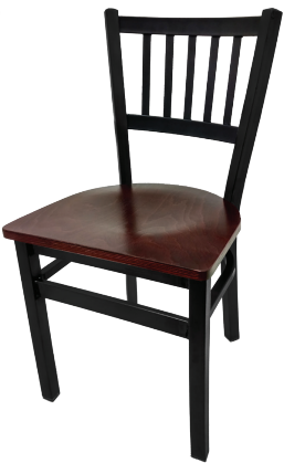
Mahogany stain Wood Seat SL2090-M