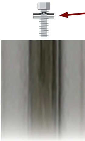
TUBE BOTTOM (SIDE)

Oak Street uses a short bolt to screw into the welded anchor plate. This is a much improved method than the competitors, which use a long rod that will torque & stretch when force is applied - making it permanently loose.