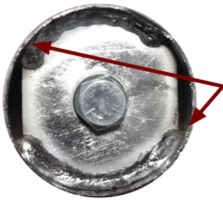
TUBE BOTTOM (BOTTOM)

Welded anchor plate at bottom of tube. Anchor plate also has a welded nut on back of anchor plate.