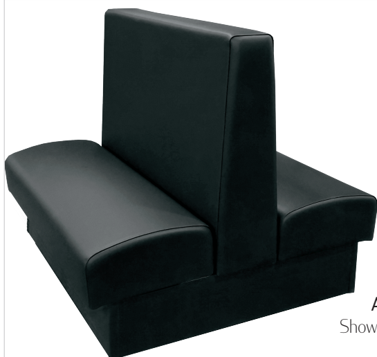
Ambrose Shown with black vinyl