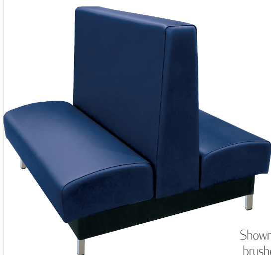
Grove Shown with navy vinyl & brushed aluminum legs