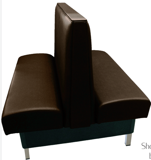
Garner Shown with espresso vinyl & brushed aluminum legs