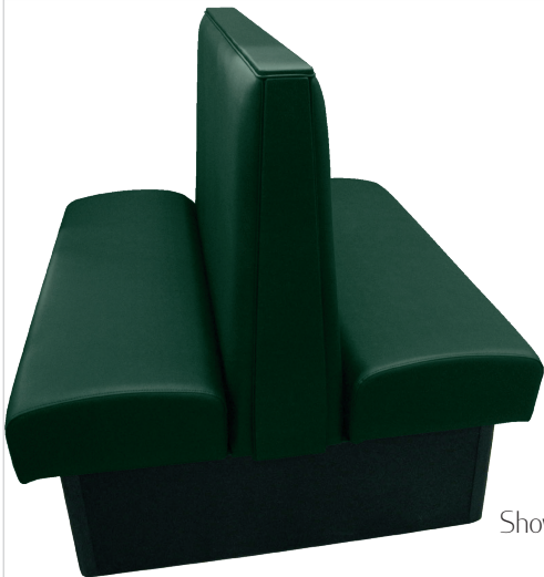
Cornell Shown with hunter green vinyl