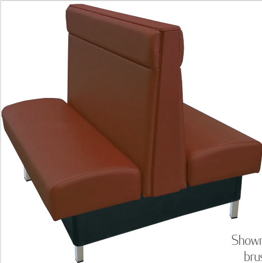
Marengo Shown with chestnut vinyl & brushed aluminum legs