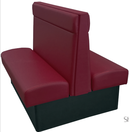
Drake Shown with wine vinyl