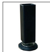
Lakota Shown with gray vinyl & black metal legs