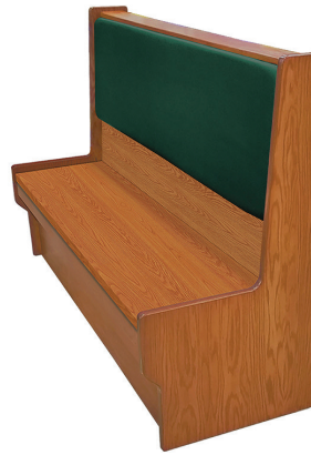
Wood Seat Vinyl Back (-WSUB)