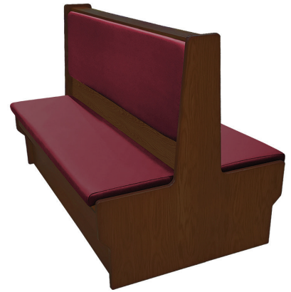
Vinyl/Upholstered Seat & Back (-VSUB)