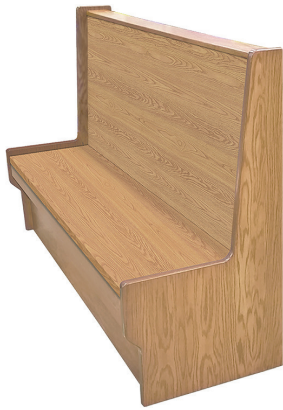
Wood Seat Wood Back (-WSWB)