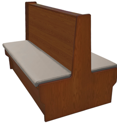
Vinyl/Upholstered Seat Wood Back (-VSWB)