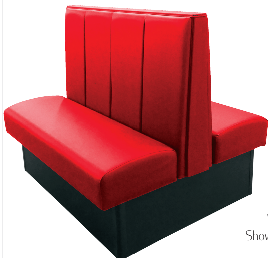
Waldorf Shown with red vinyl