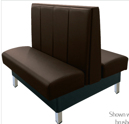
Asbury Shown with espresso vinyl & brushed aluminum legs