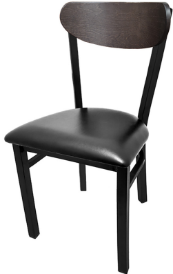
Driftwood stain wood back & Black vinyl seat CM-262-DW-BLK