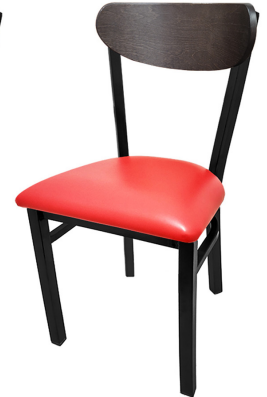
Driftwood stain wood back & Red vinyl seat CM-262-DW-RED