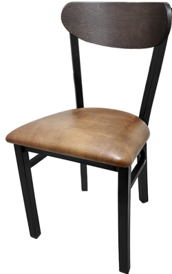
Driftwood stain wood back & Buckskin vinyl seat CM-262-DW-BUC