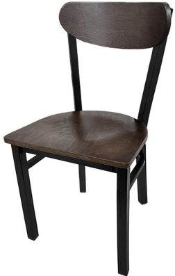
Driftwood stain wood back & seat CM-262-DW