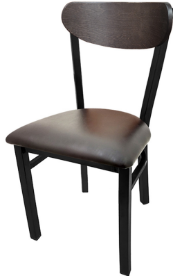
Driftwood stain wood back & Espresso vinyl seat CM-262-DW-ESP