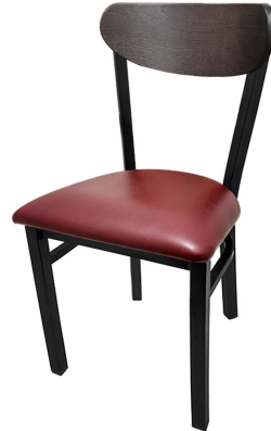
Driftwood stain wood back & Wine vinyl seat CM-262-DW-WINE