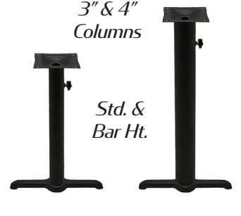
Std. & Bar Ht.