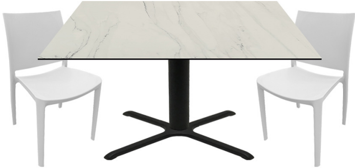
COMPCOR HPL Table Top (Modern Marble) + Outdoor Cross Base with Teton Resin Chairs (White)