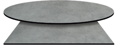
COMPCOR HPL Table Top (Textured Concrete)