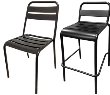
Boardwalk (Black) Steel