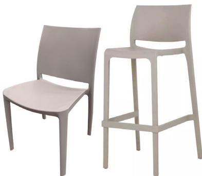
Teton (Greige) Resin