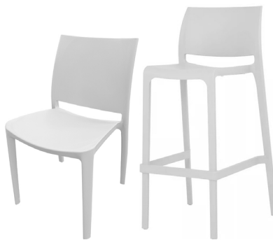
Teton (White) Resin