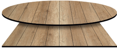
COMPCOR HPL Table Top (Vintage Oak)