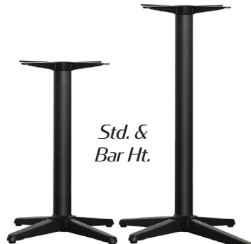
Std. & Bar Ht.