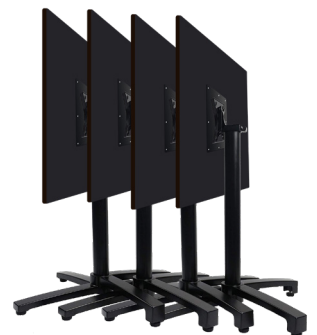
Folding Table Bases

NOROCK table bases use a simple mechanical system with four pivoting legs that are interconnected in such a way that they must reach an average weight loading on all four feet. When a table is placed on an uneven surface, the feet will move until all four feet reach a state of equilibrium.