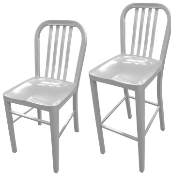
Navy (Silver) Aluminum