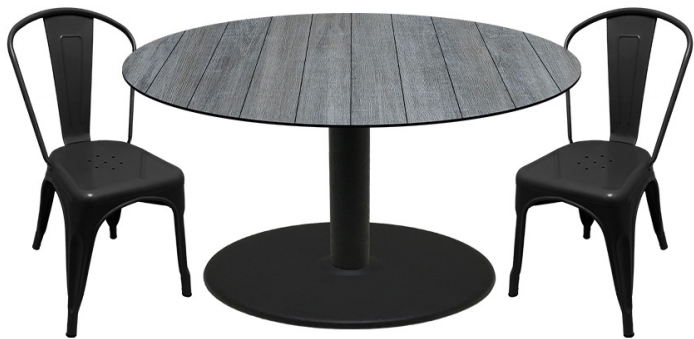
COMPCOR HPL Table Top (Weathered Pewter) + Outdoor Disc Base with Smokestack Chairs