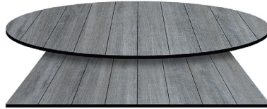
COMPCOR HPL Table Top (Weathered Pewter)