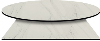
COMPCOR HPL Table Top (Modern Marble)