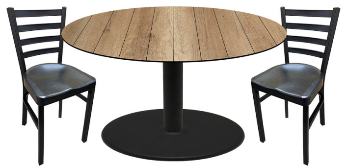
COMPCOR HPL Table Top (Vintage Oak) + Outdoor Disc Base with Outdoor Ladderback Chairs (Metal Seat)