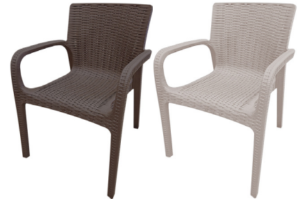
Rainier (Cafe Brown) Resin Rainier (Greige) Resin