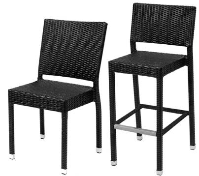
Rattan (Black) Aluminum + Synthetic