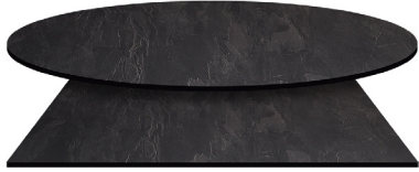
COMPCOR HPL Table Top (Raven Slate)