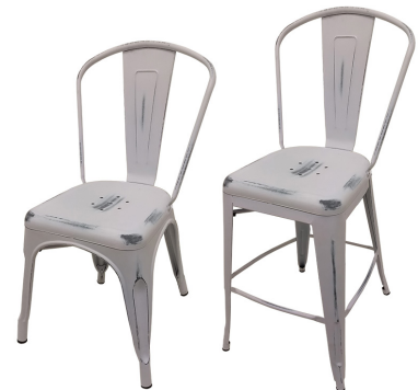
Smokestack (Distressed White) Steel