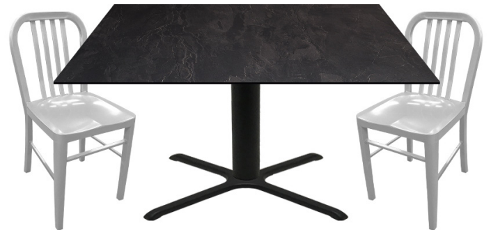
COMPCOR HPL Table Top (Raven Slate) + Outdoor Cross Base with Outdoor Navy series Chairs