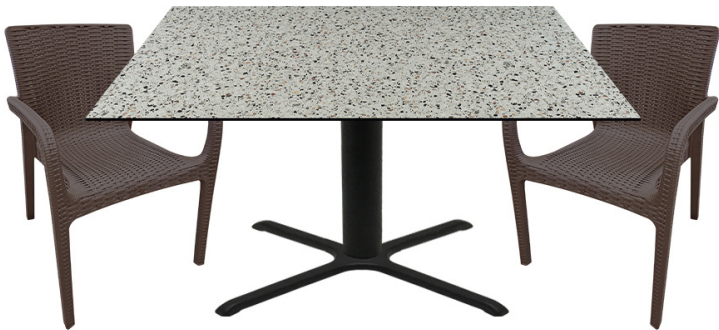
COMPCOR HPL Table Top (Maremme) + Outdoor Cross Base with Rainier Resin Chairs (Cafe Brown)