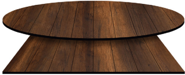
COMPCOR HPL Table Top (Knotty Oak)