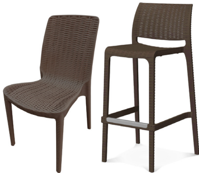
Olympus (Cafe Brown) Resin