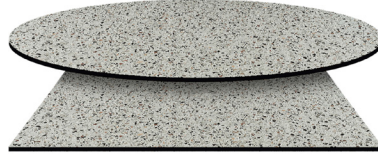
COMPCOR HPL Table Top (Maremma)