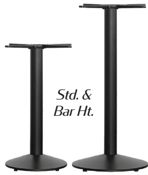
Std. & Bar Ht.

NOROCK table bases use a simple mechanical system with four pivoting legs that are interconnected in such a way that they must reach an average weight loading on all four feet. When a table is placed on an uneven surface, the feet will move until all four feet reach a state of equilibrium.