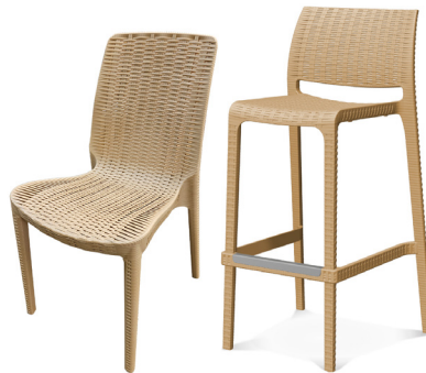
Olympus (Camel Tan) Resin