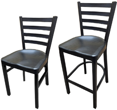
Outdoor Ladderback w/ Metal Seat (Black) Steel