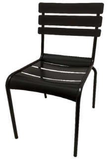
Slatback (Black) Steel