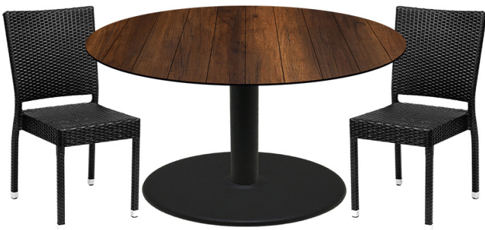
COMPCOR HPL Table Top (Knotty Oak) + Outdoor Disc Base with Rattan Chairs