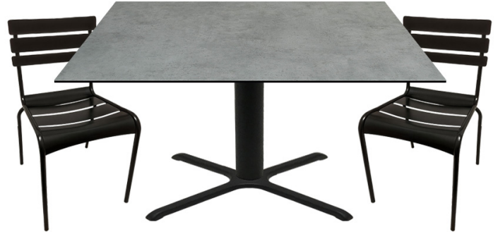
COMPCOR HPL Table Top (Textured Concrete) + Outdoor Cross Base with Slatback Chairs