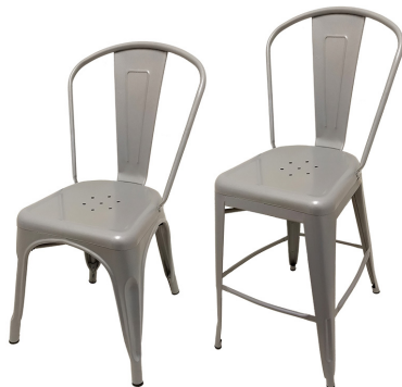
Smokestack (Silver) Steel