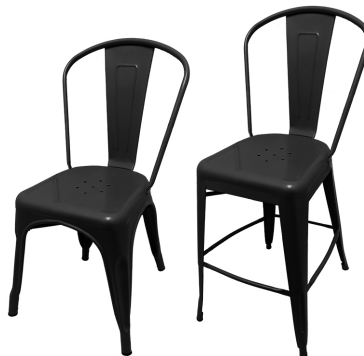
Smokestack (Black) Steel